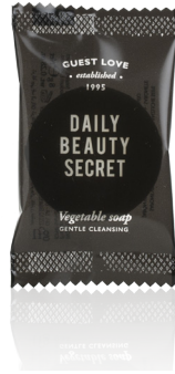
VEGETABLE SOAP 8 g e Net wt. 0.28 oz. B0808GL