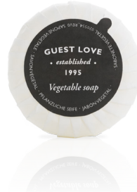
VEGETABLE SOAP 20 g e Net wt. 0.70 oz. B0220GL