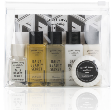
POCHETTE AMENITIES 15 x 12,5 x 4,5 cm K052GL

This vegetable soap is the ideal body care bar to use on a daily basis. Its gentle cleansing action can be used all over the body to leave the skin clean and refreshed.