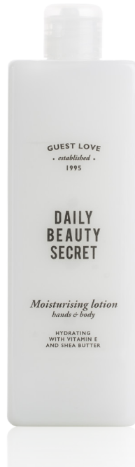
MOISTURISING LOTION 480 ml e 16.23 fl. oz. FLR500BLGL

DERMATOLOGICALLY TESTED NICKEL TESTED PARABEN FREE NO BHT