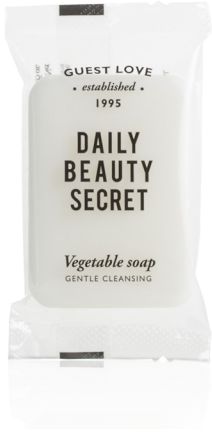
VEGETABLE SOAP 30 g e Net wt. 1.05 oz. B0830GL