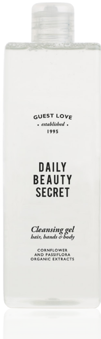
CLEANSING GEL 480 ml e 16.23 fl. oz. FLR500MGL

This cleansing gel is enriched with cornflower and passiflora organic extracts with relaxing properties for a delicate wash leaving hair and body feeling invigorated and vibrant.